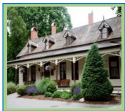
The Mesier Homestead

Pease donate to the Homestead Preservation Fund. Make checks payable to the Wappingers Historical Society.